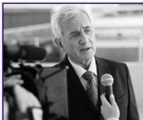
Impactful Interviews »