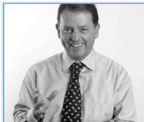
What do we do? »