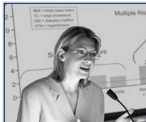
Presenting Medical Data »