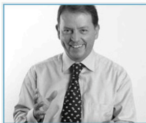
What do we do? »