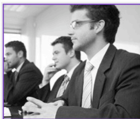
Chairing and Facilitation »